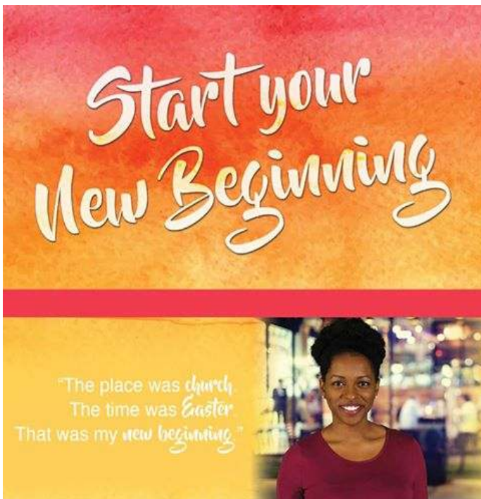
Use these special cards, which are available at the church house, to invite people to our Easter services.

Byromville Baptist Church 713 Patterson Street